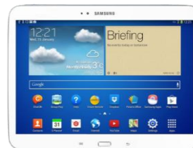
Your device anywhere