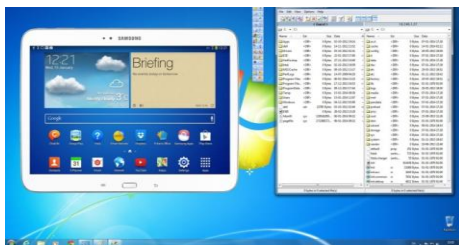
Tablet viewed remotely from Windows desktop Simultaneous split-screen file transfer

PC – Mac – Tablet – Smartphone – Embedded device