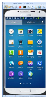
Smartphone remote control from Windows PC window

With Wisemo® products, you can remotely reach PCs, Mac, Tablets and Smartphones, no matter where they are. You can do so from a Browser, a Windows program, an Android App or from your iPhone or iPad. You connect over the Internet or via your own controlled LAN/WAN network (tcp/ip), and you do it securely. You get a powerful tool that helps you to remotely provide user support and maintenance, across multiple platforms and devices, or to reach those critical computers and devices located far away or placed in inaccessible environments. With Wisemo, you increase your efficiency and greatly reduce costs.