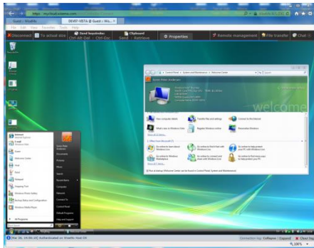
Remote Control of Windows PC from a Browser.