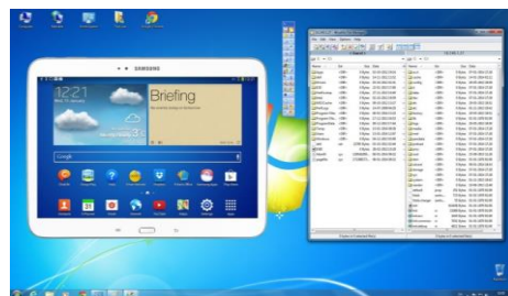
PC remote controlling an Android Tablet Image of device displayed on the desktop. Live screen and active device buttons.